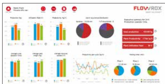
Flowrox troubleshooting tools detect abnormalities in the process and automatically send alarms via email.

With Smart Filtration Digital Service, operators can optimize filtration process, increase production volume and detect failures before they even occur. All that can be done from anywhere with any computer, smart phone or other handheld device with internet connection.