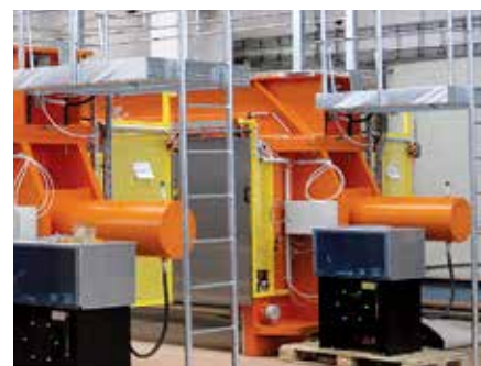
Safety comes first: Flowrox Filter Press is always equipped with safety covers and system to ensure safe operation.