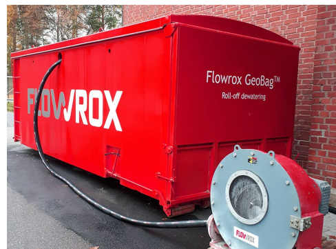
Flowrox GeoBag™ roll-off unit saves water and makes transport of waste much easier.

Geotextile filtration can remarkably reduce the costs related to waste handling. Depending on the quality of the sludge you can remove up to 90 % of water. To avoid major investments, we can also provide full operative service based on monthly or handling fee.