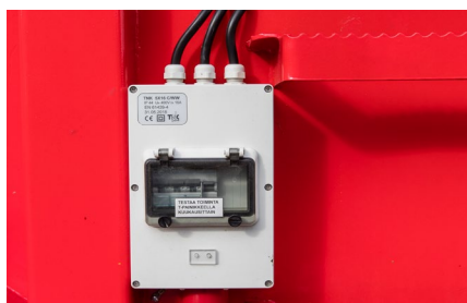
The GeoBag™ units can be isolated and heated for areas with colder climates.