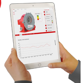
Malibu™ portal is user-friendly and easy to navigate.