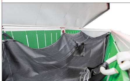
Geotextile bag effectively separates solids from water.